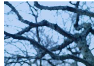
on a branch