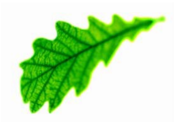
on a leaf

3. Where does the bird put the twigs in its beak?